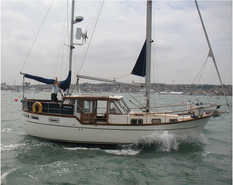
Old Possum on passage to Cowes

A QUARTERLY NEWSLETTER FOR NAUTICAT ASSOCIATION MEMBERS