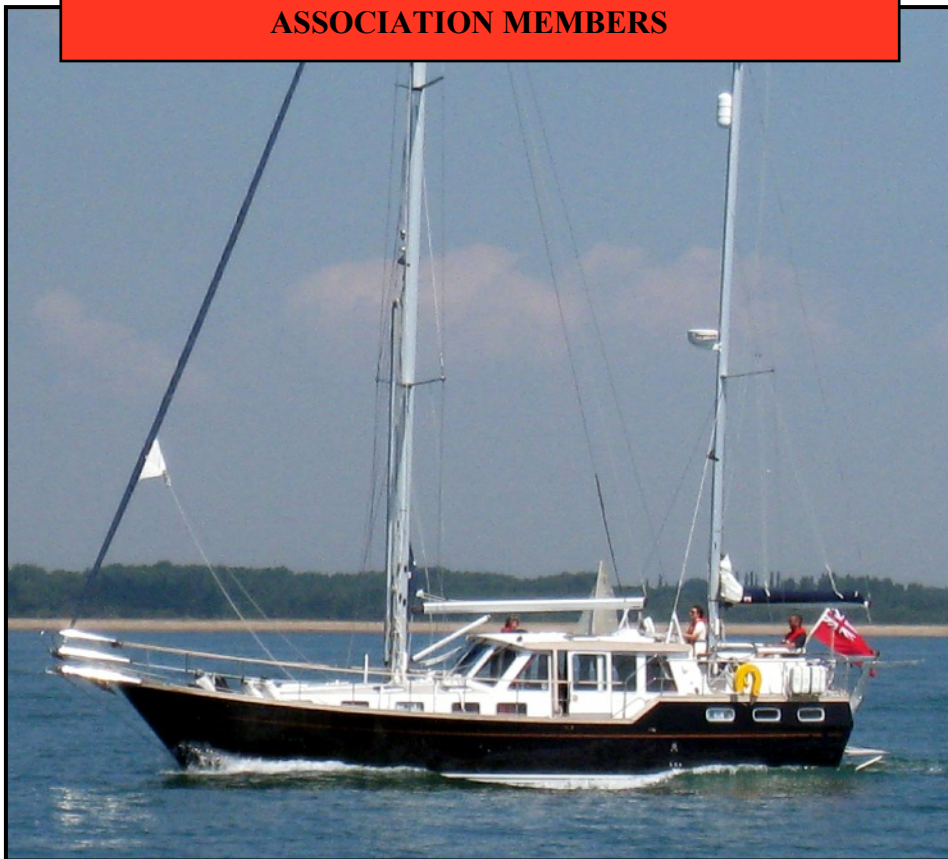
An unknown Nauticat in the Solent

A THRICE YEARLY NEWSLETTER FOR NAUTICAT ASSOCIATION MEMBERS